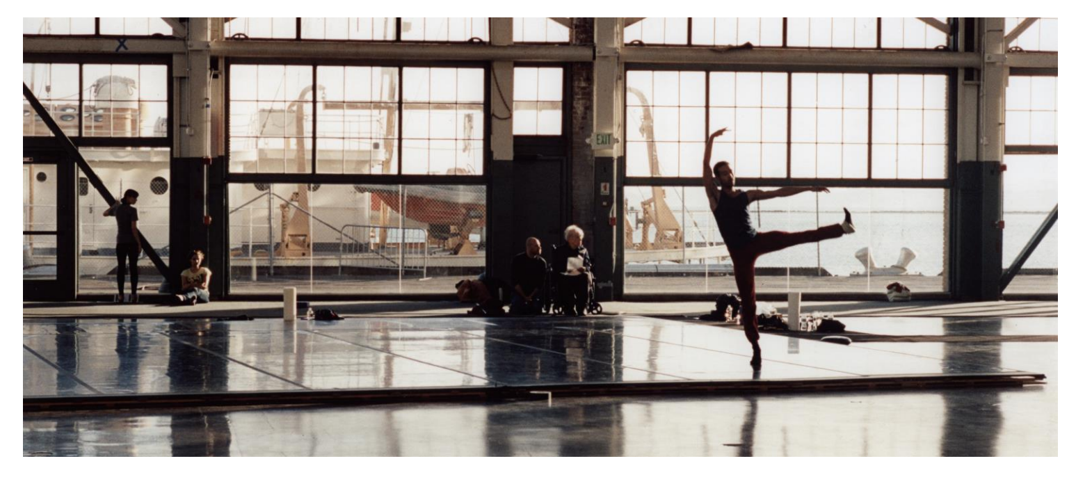
Tacita Dean, Craneway Event, 2009, 16 mm colour anamorphic film, optical sound, 108 min. Film still.