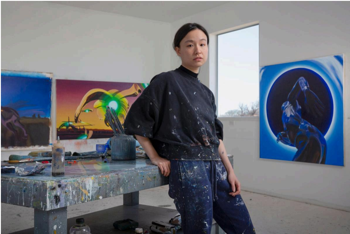
Yifan Jiang, Cafeteria (detail), 2025.