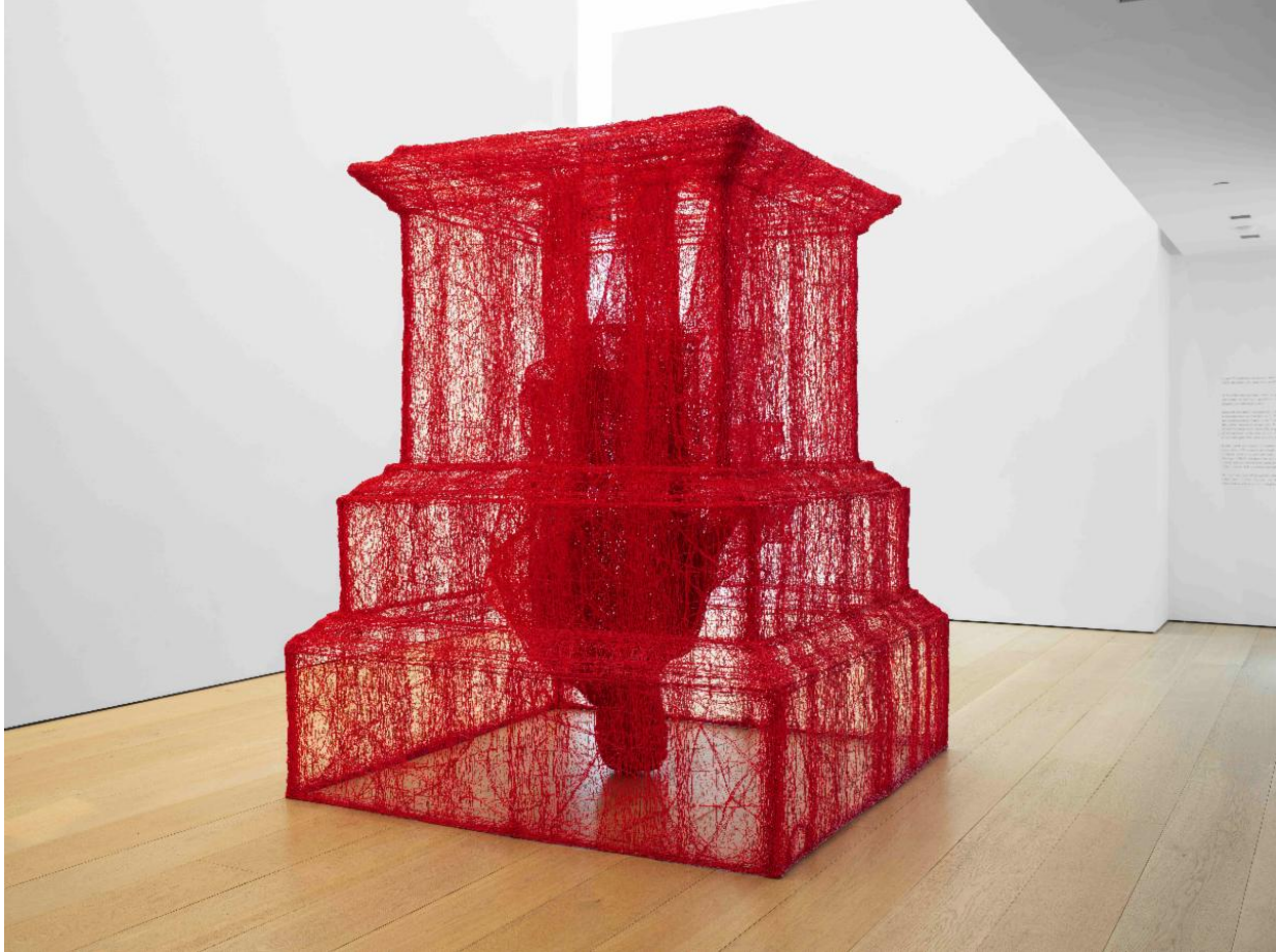
Do Ho Suh, Inverted Monument , 2022. © Do Ho Suh. Courtesy of the artist; Lehmann Maupin, New York and Seoul; Victoria Miro, London/Venice. Installation view at Lehmann Maupin New York, 2022. Photography by Christopher Payne.

Following presentations in Seoul, London, Brooklyn, and now in Houston, Artland is a fantastical ecosystem dreamed up in 2016 by artist Do Ho Suh and his two young daughters. Comprised of a series of fantastical islands inhabited by colorful creatures and wondrous plants, creative visitors of all ages will be invited to contribute their own elements to the work and to imagine alternative universes powered by the human imagination.