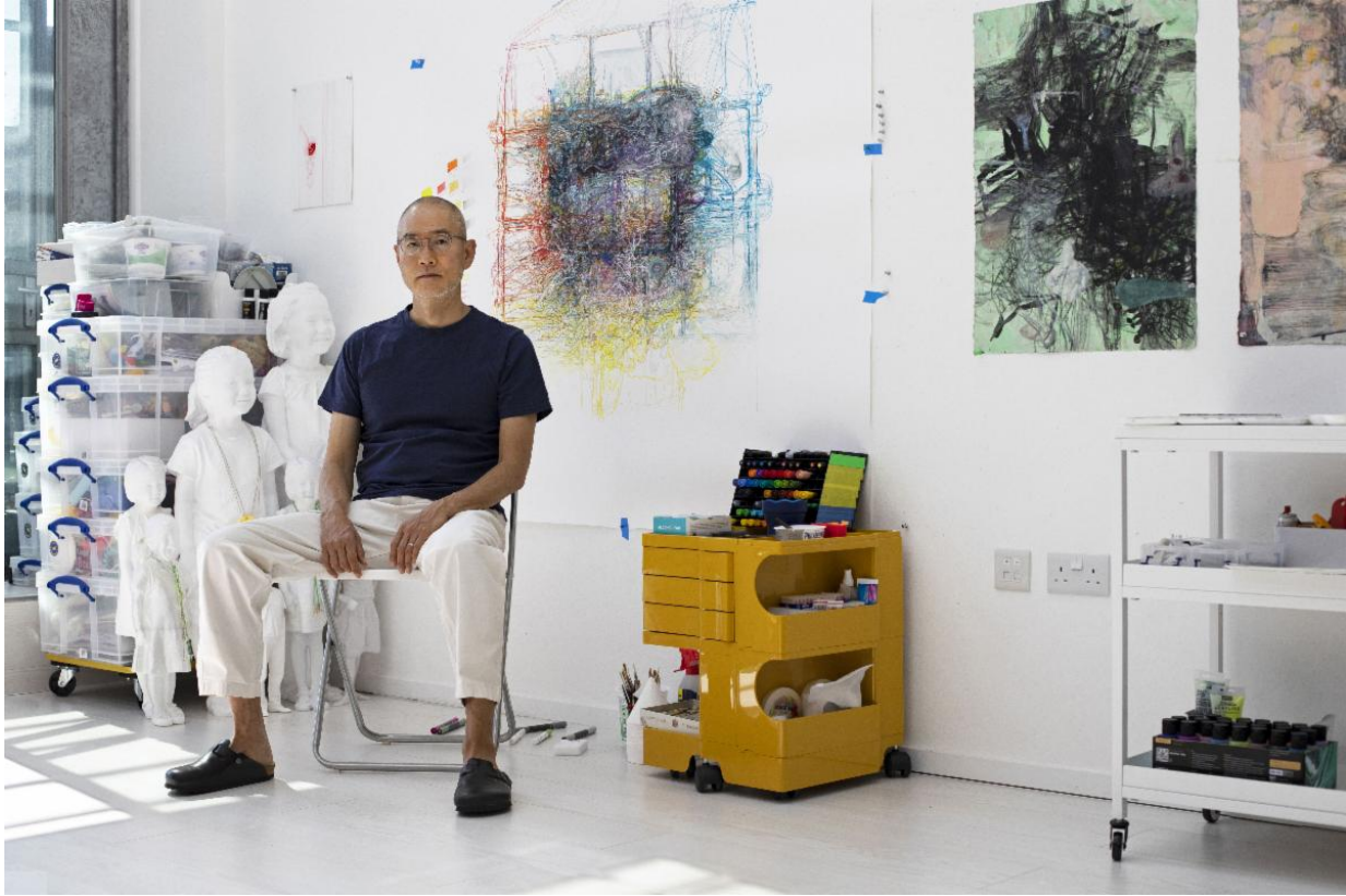
Portrait of Do Ho Suh

Having lived primarily between the cities of Seoul, New York and London, Do Ho Suh's (b. 1962, Seoul, South Korea) work explores concepts of home, both physically and psychologically, as well as issues of displacement, migration, memory, and the passage of time. Through sculpture, works on paper, and video, the artist invites us to consider topics ranging from personal identity to the socio-political implications of our actions in a complex, ever-changing world.