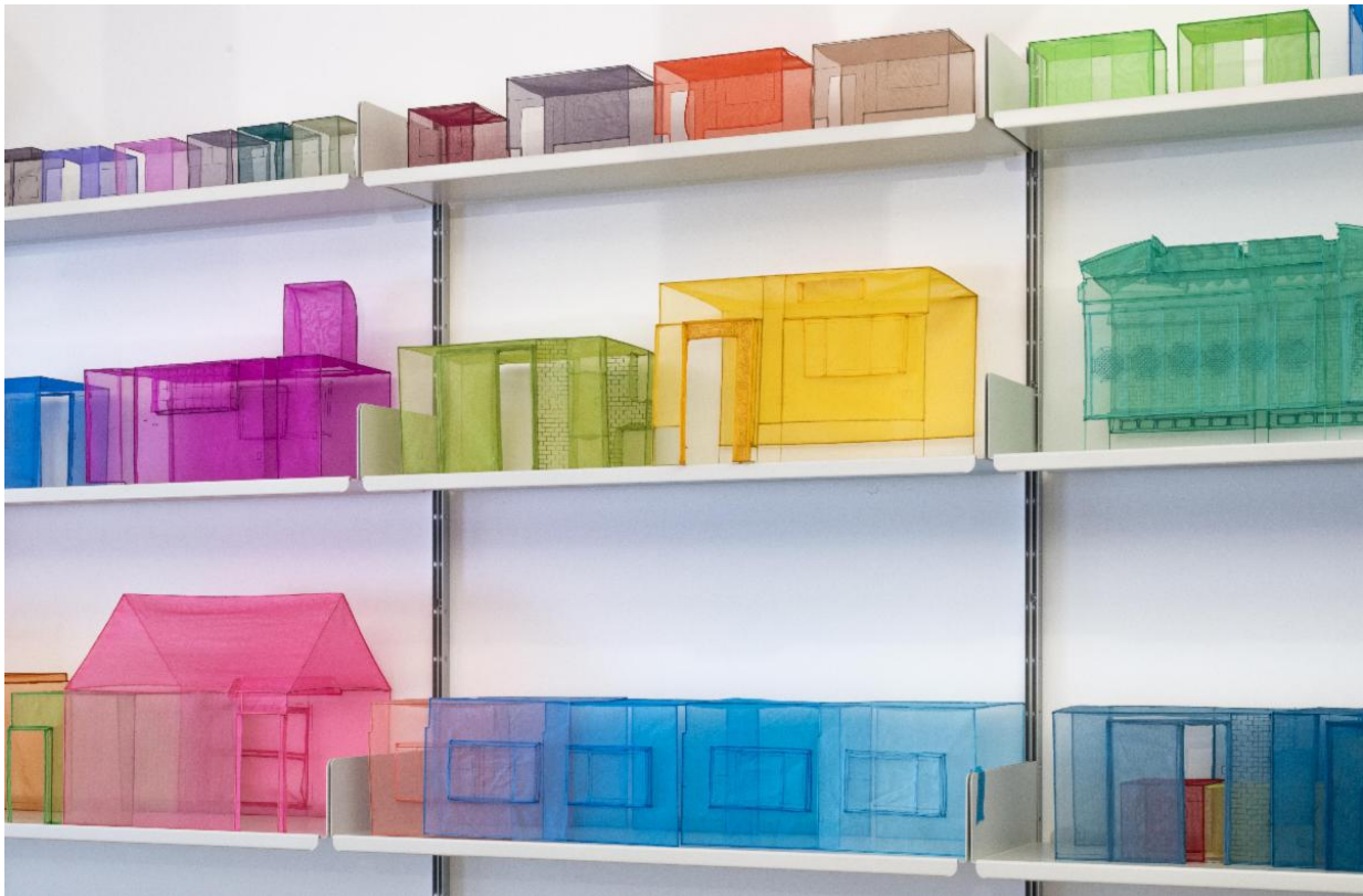
View from Do Ho Suh's studio in London UK, 2024 Example of maquettes on display in Do Ho Suh: In Process

June 20, 2024 [Houston, TX] -- The Moody Center for the Arts at Rice University will inaugurate its Fall 2024 season with an innovative presentation of works by the internationally renowned artist Do Ho Suh, opening September 6, 2024. The first exhibition of its kind by Do Ho Suh, In Process forgoes the formalities of a traditional gallery display in favor of creating a studio-like space highlighting the artist's research and collaborative projects. By privileging the dynamics of open experimentation over the finality of the end result, In Process invites visitors to experience the methodologies by which Do Ho Suh iterates on ideas, engages experts from diverse fields, and expresses complex themes