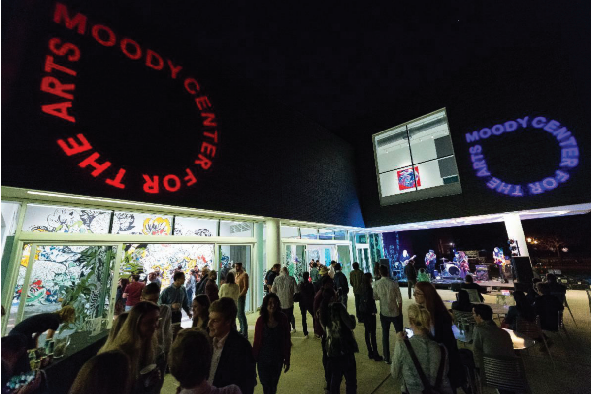
Moody Center for the Arts